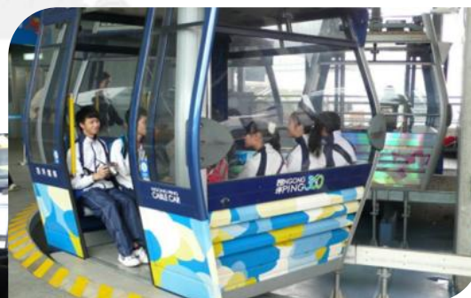
Tourism and Hospitality: Ngong Ping 360 on 5 Mar 2011