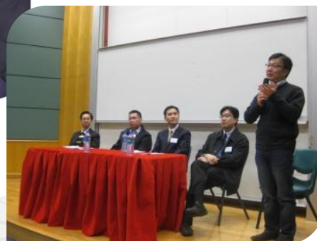
Mental & Behavioral Health Study forum & Interview with psychiatrists on 26 Feb 2011