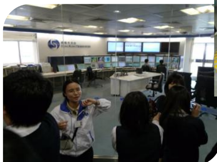
Environment Hong Kong Observatory on 5 Mar 2011