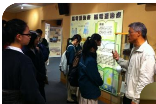
Mental & Behavioral Health Castle Peak Hospital on 21 Feb 2011