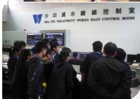
Environment Sha Tin Water Treatment Works on 2 Mar 2011