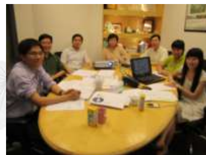
Meeting with teachers and mentors